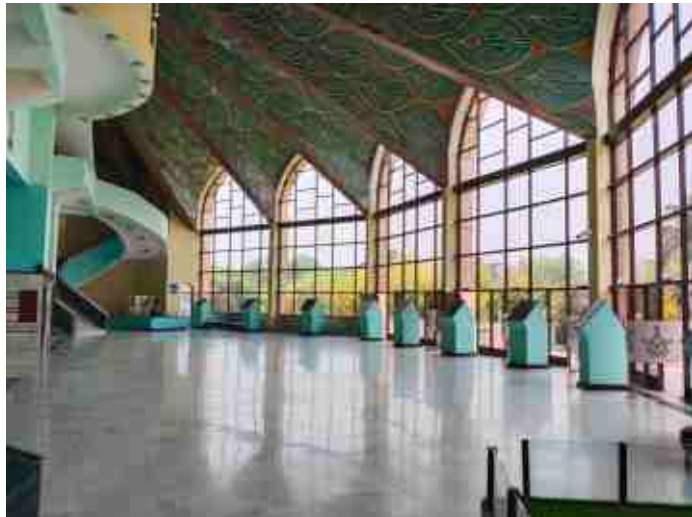
Foyer exhibition area